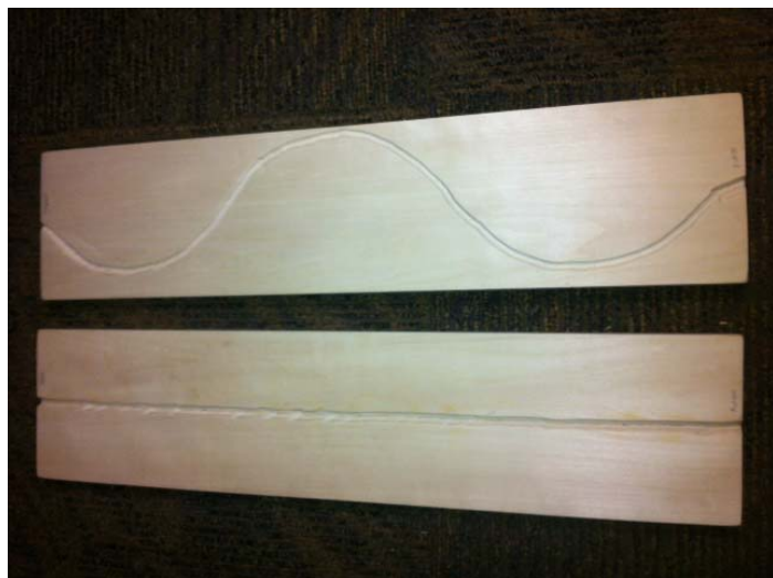
Photo of a curvy and a straight stream board.